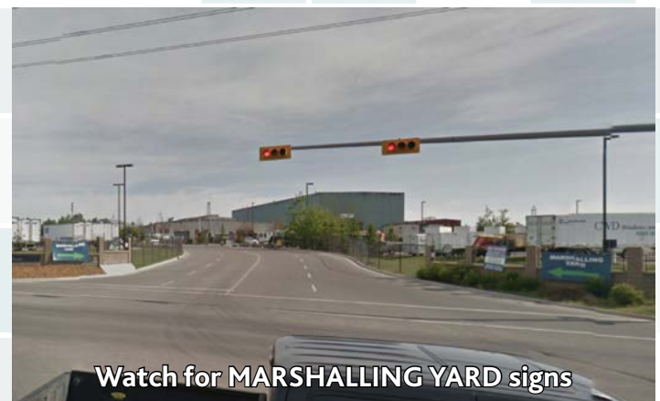
Watch for MARSHALLING YARD signs