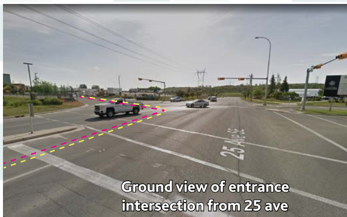
Ground view of entrance intersection from 25 ave